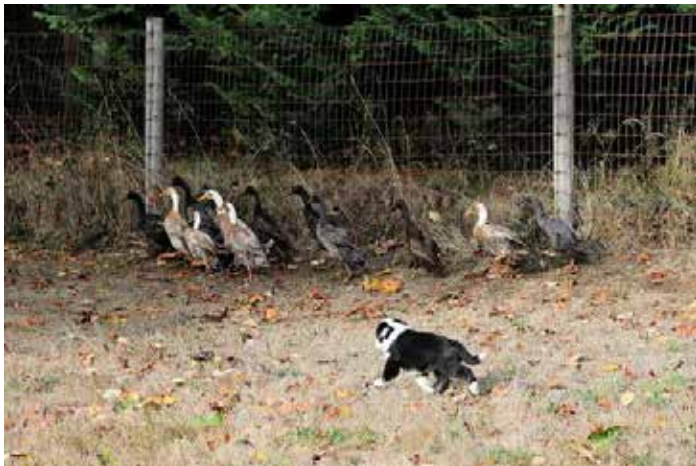
Lottie with a larger flock of ducks