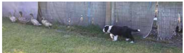
Kate, at four months