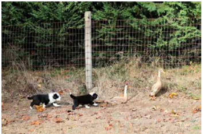
Eddie and Lottie, "Hello duck."