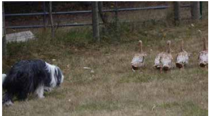
Kate as an adult