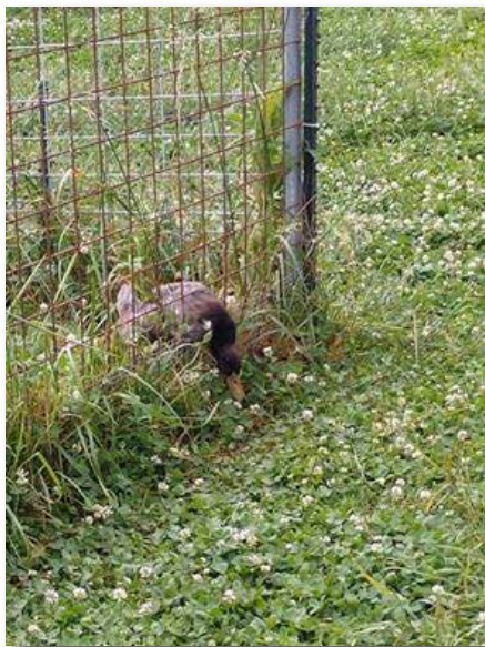
Here's a couple of photos of one really aggressive guy trying to get at two on the other side of the fence panel.

I have two groups of male ducks for training, having traded out my flighty sheep with due respect for my precious lower extremity joint replacements. Three older ducks have been together several years as one group and the other group has 13 year and a half old Blue Swedes. They each have their separate nighttime predator protected places within a fully fenced/roofed