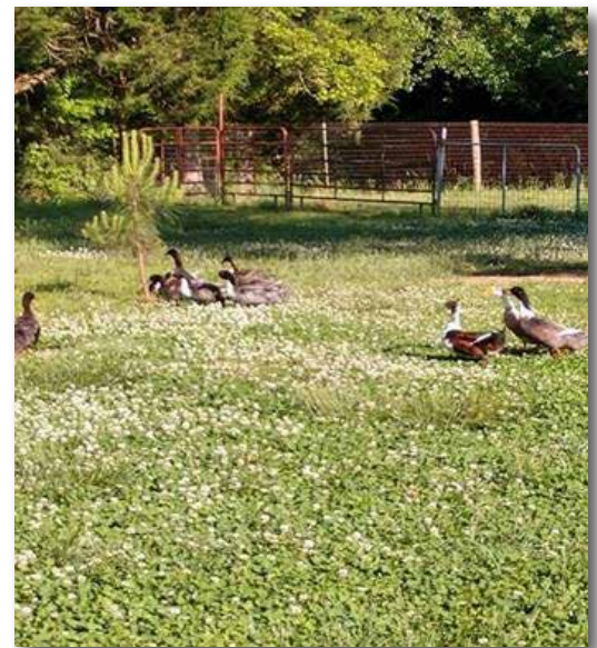
Another photo of the older group about to move the young group away.

As a result, I now have four separate groups – the elder three, nine young ones that generally are not terrorizing group members, two and two. The twos are securely separated from the others and each other with wire fencing. All spend considerable time fence walking or running, head/neck dipping, quacking, and trying to fight through the fence – it is amazing to watch and tiresome management to keep the lots separate. Periodically I put the two groups of twos back together or a two group and the larger group – with immediate nasty heckling behavior. With gates opened correctly, the subordinates know exactly where their safe spaces are.