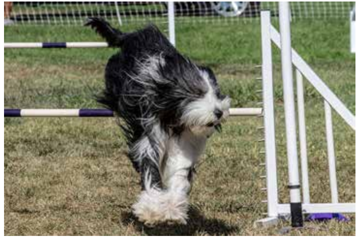
Wilowisp Echo Of The Past