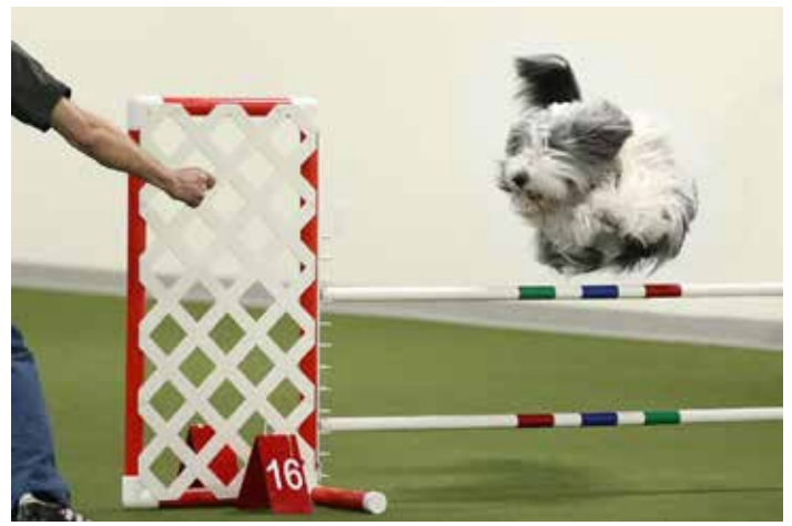
Wigglesworth Pride And Prejudice

The BCCA honors the top agility teams at each competition level (Novice/Open/Excellent/Master) in both regular Standard and Jumpers With Weaves (JWW) and Veteran Beardies competing in the Preferred classes. The complete scoring systems for these awards can be found on the BAD website - <u>www.</u> BeardieAgilityDiehards.org