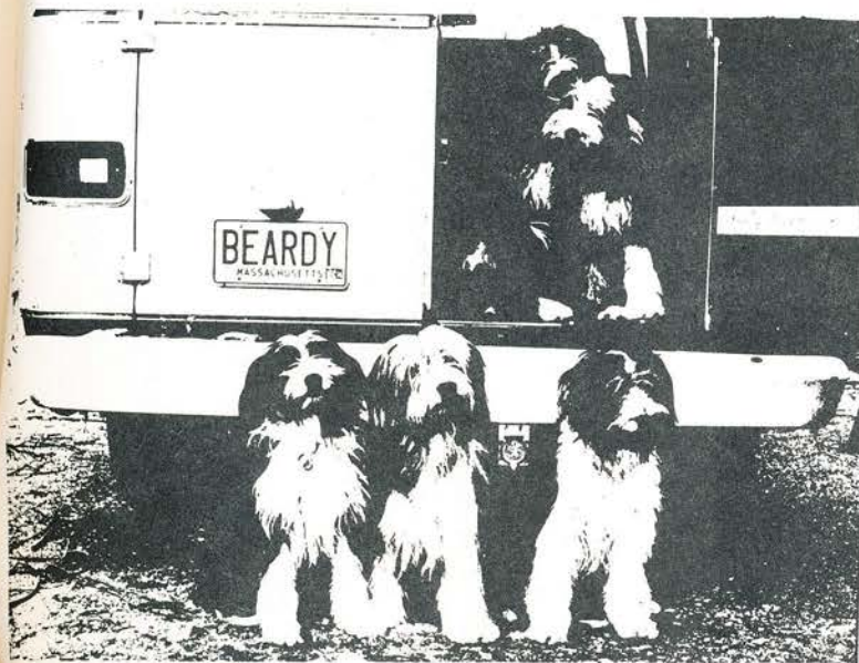
Massachusetts - "Beardie (y) Van" and the Braemoor Beardies