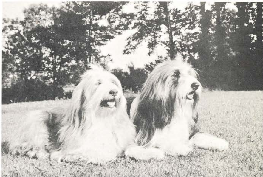
Some English friends- Wishanger Comb Honey and Ch Rowdina Rustler above and Ch. Broadholme Cindy Sue of Willowmead below