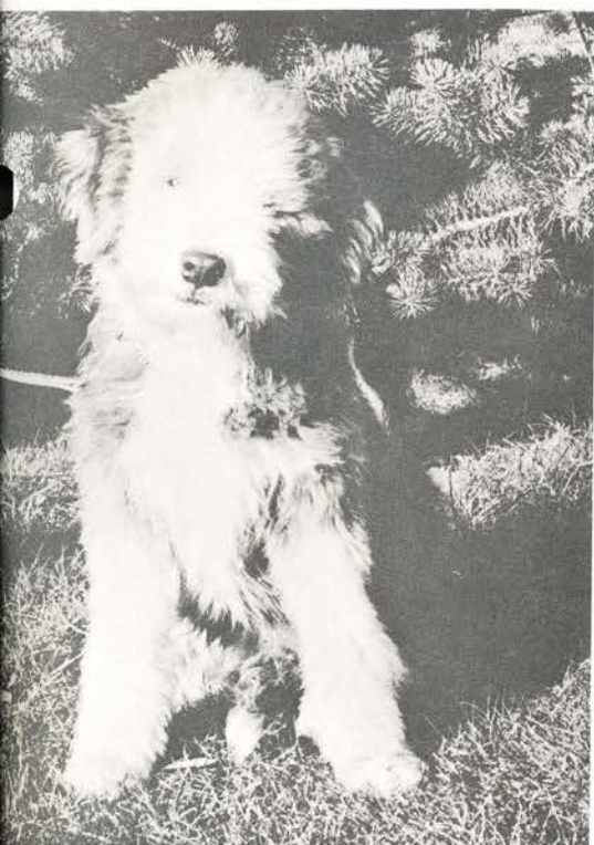
Benji is a good boy