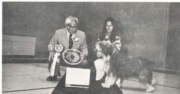
Chicago-Jaseton Princess Argonetta