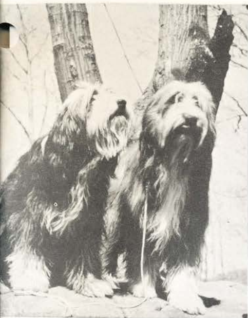
King(s) of the Mountain Brig and Larky