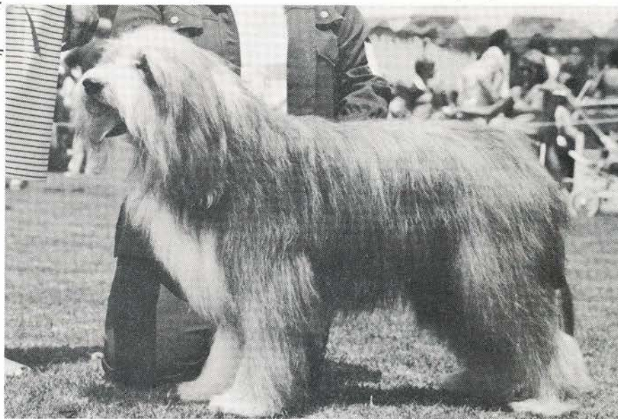
CH. SHIEL'S MOGADOR SILVERLEAF C.D.

"Kent" congratulates his four new Champion sons!