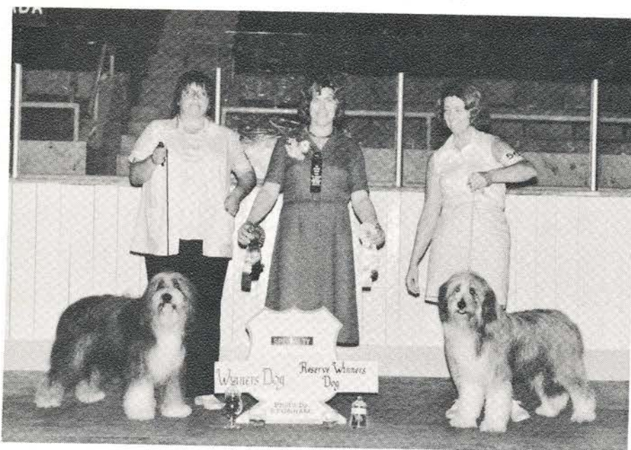
CH SHIEL'S MOGADOR SILVERLEAF & son CH* WYNDCLIFF STONEMARK OLIVER