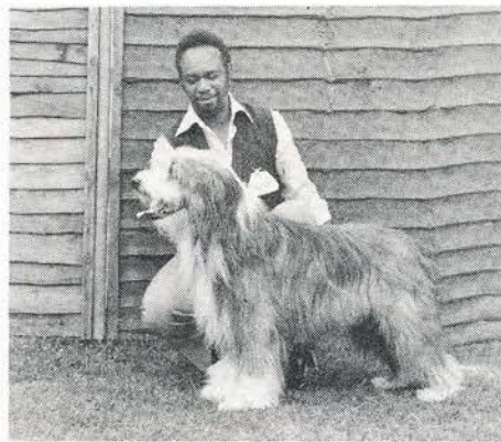
Ch. Davealex Royle Baron 3 C.C.s 2 Res. C.C.s