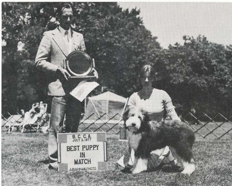
Glen Eire's Willie Wonderful (Can. Ch. Misty Shadow of Willowmead ex Luath Bonnie Blue Bairn)